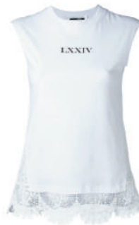
Cut & Sewn Knit