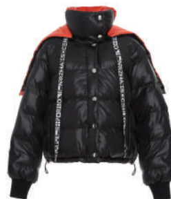
Proenza Schouler PSWL