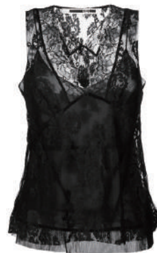
McQ - Alexander McQueen